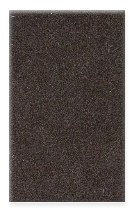
1775-HSN17 IRON MOUNTAIN Finish: HS Natural Sealer: WB Matte