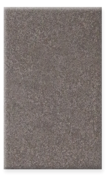
1760-HSN17 TWILIGHT GREY Finish: HS Natural Sealer: WB Matte