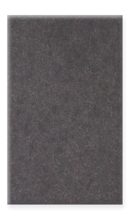
1800-HSN17 CHELSEA GRAY Finish: HS Natural Sealer: WB Matte

1805-DG17 CHARCOAL Finish: 200 Diamond Grind Sealer: WB Matte