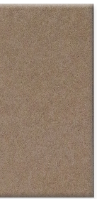
1740-HSN17 HOT SPRING STONES Finish: HS Natural Sealer: WB Matte