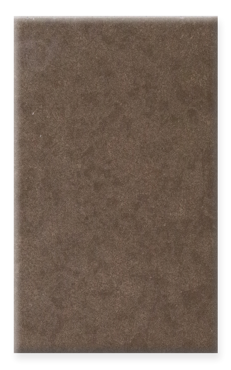
1745-HSN17 ALEXANDRIA BEIGE Finish: HS Natural Sealer: WB Matte