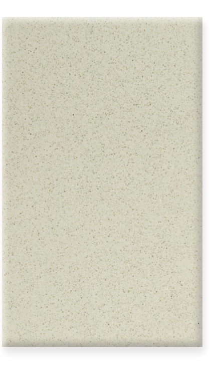
1710-DG17 EDGECOMB GREY Finish: 200 Diamond Grind Sealer: WB Matte

1705-DG17 WHITE SAND Finish: 200 Diamond Grind Sealer: WB Matte