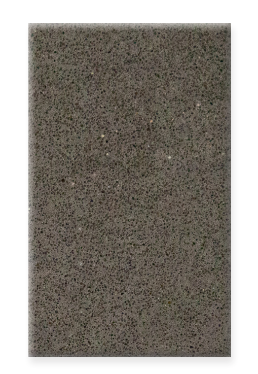
1765-DG17 BEAR CREEK Finish: 200 Diamond Grind Sealer: WB Matte