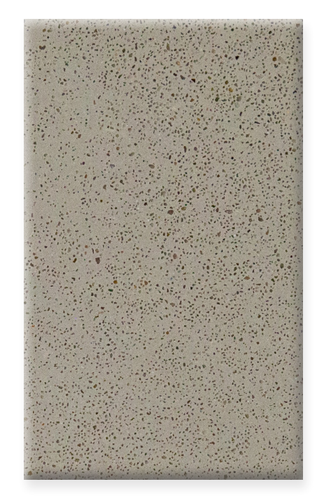
1750-DG17 ASH Finish: 200 Diamond Grind Sealer: WB Matte