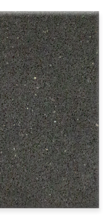
1810-DG17 STORMY SKY GRAY Finish: 200 Diamond Grind Sealer: WB Matte