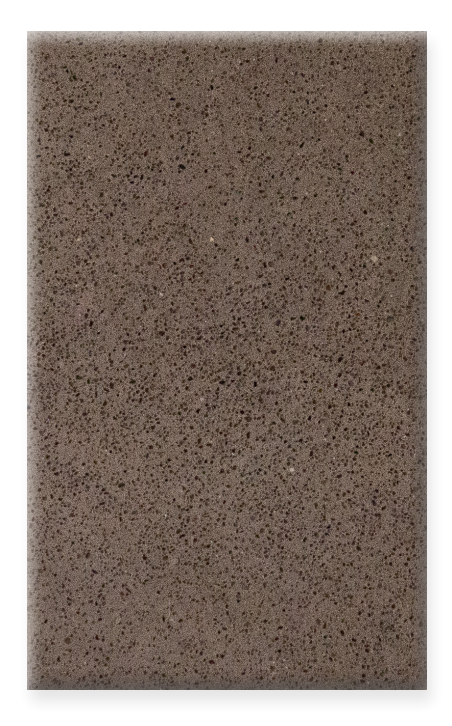
1745-DG17 ALEXANDRIA BEIGE Finish: 200 Diamond Grind Sealer: WB Matte