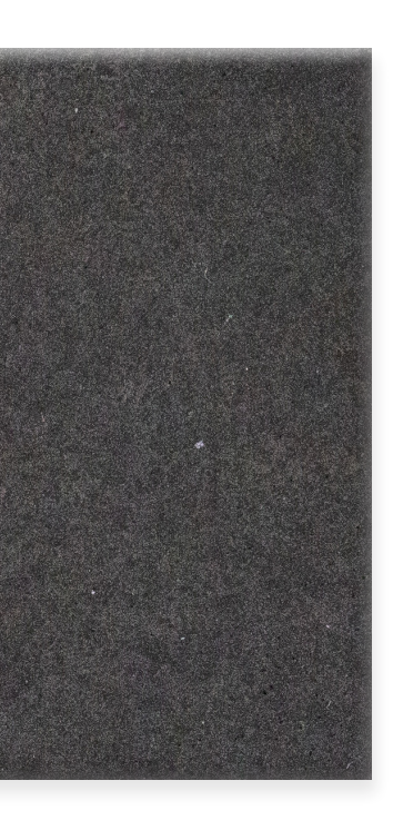
1770-HSN17 DUSK Finish: HS Natural Sealer: WB Matte