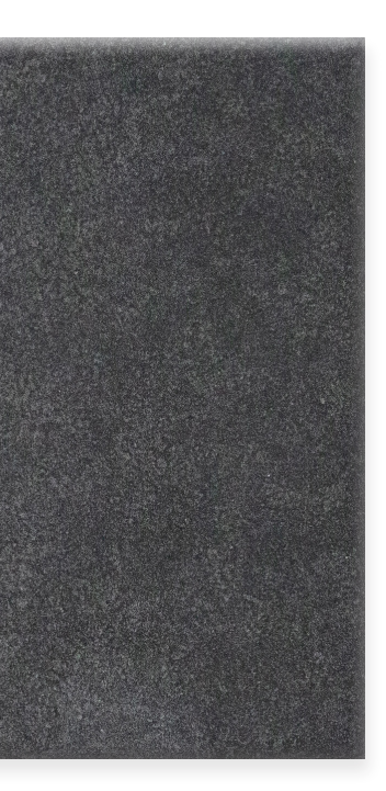
1810-HSN17 STORMY SKY GRAY Finish: HS Natural Sealer: WB Matte