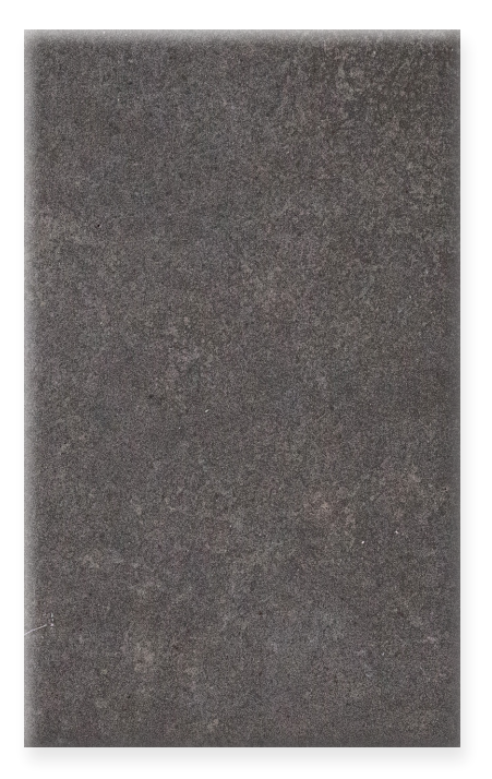
1765-HSN17 BEAR CREEK Finish: HS Natural Sealer: WB Matte