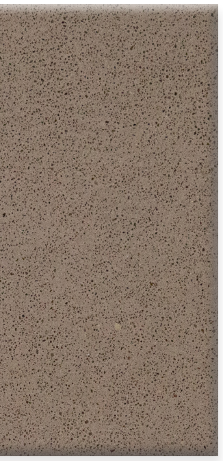
1740-DG17 HOT SPRING STONES Finish: 200 Diamond Grind Sealer: WB Matte Ο