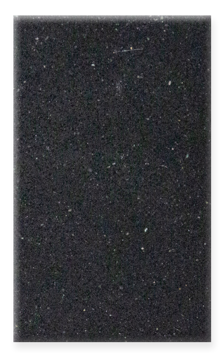
1815-DG17 HARD TOPIX BLACK Finish: 200 Diamond Grind Sealer: WB Matte