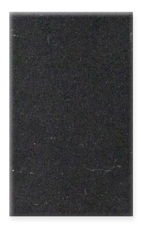
1815-HSN17 HARD TOPIX BLACK Finish: HS Natural Sealer: WB Matte