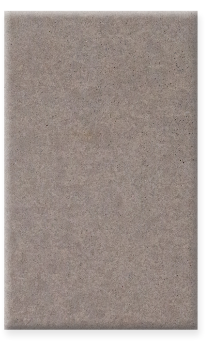
1755-HSN17 HARBOR GRAY Finish: HS Natural Sealer: WB Matte