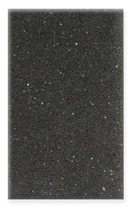
1775-DG17 IRON MOUNTAIN Finish: 200 Diamond Grind Sealer: WB Matte