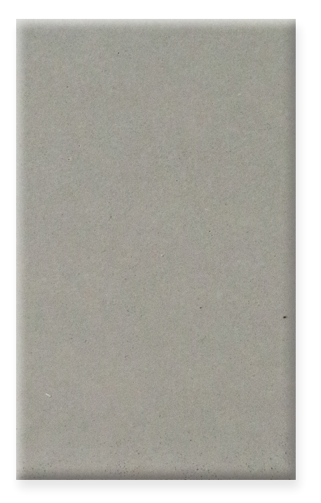
1750-HSN17 ASH Finish: HS Natural Sealer: WB Matte