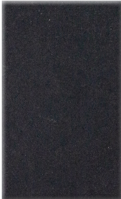
1805-HSN17 CHARCOAL Finish: HS Natural Sealer: WB Matte