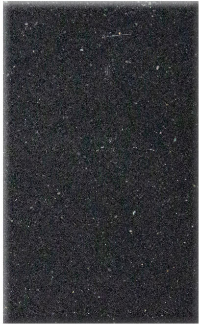
1815-DG17 HARD TOPIX BLACK Finish: 200 Diamond Grind Sealer: WB Matte