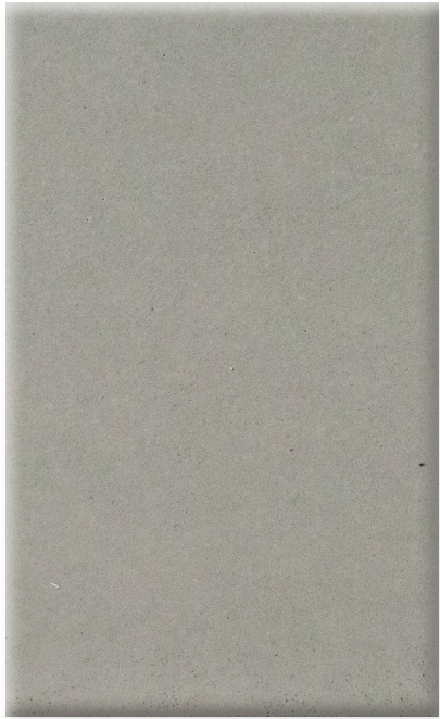
1750-HSN17 ASH Finish: HS Natural Sealer: WB Matte