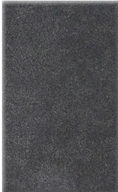
1810-HSN17 STORMY SKY GRAY Finish: HS Natural Sealer: WB Matte