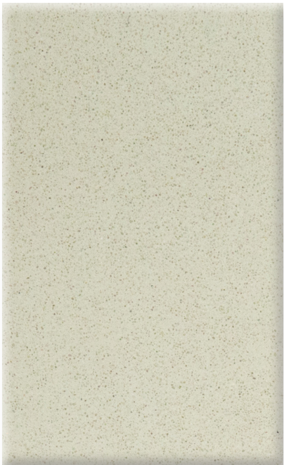
1710-DG17 EDGEComb GREY Finish: 200 Diamond Grind Sealer: WB Matte