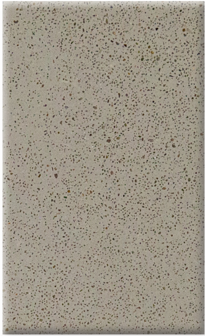
1750-DG17 ASH Finish: 200 Diamond Grind Sealer: WB Matte ○