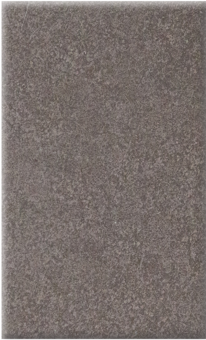
1760-HSN17 TWILIGHT GREY Finish: HS Natural Sealer: WB Matte