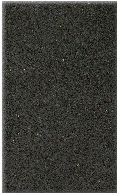
1805-DG17 CHARCOAL Finish: 200 Diamond Grind Sealer: WB Matte