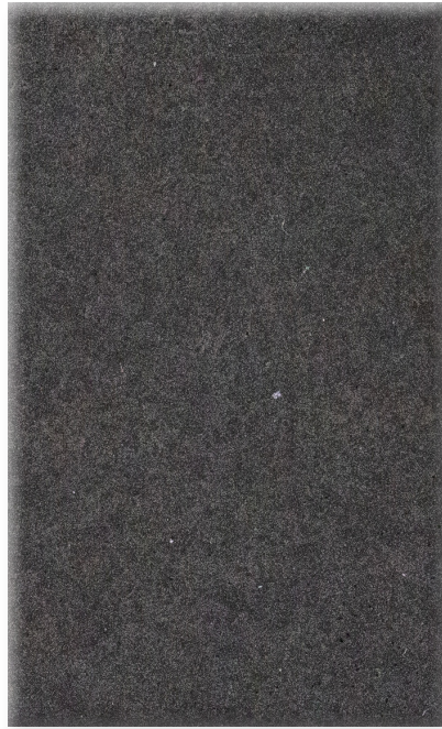
1770-HSN17 DUSK Finish: HS Natural Sealer: WB Matte