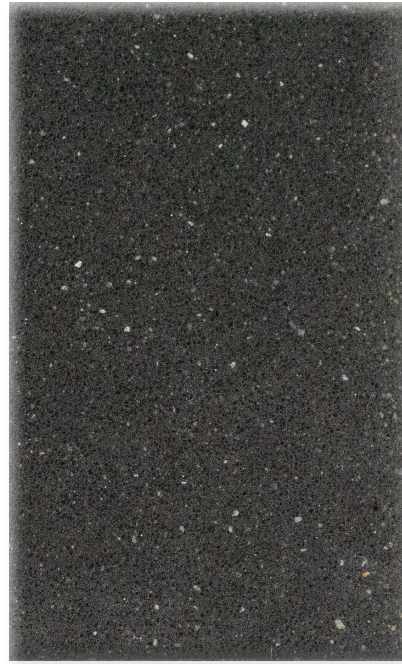
1775-DG17 IRON MOUNTAIN Finish: 200 Diamond Grind Sealer: WB Matte