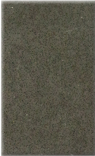
1800-DG17 CHELSEA GRAY Finish: 200 Diamond Grind Sealer: WB Matte