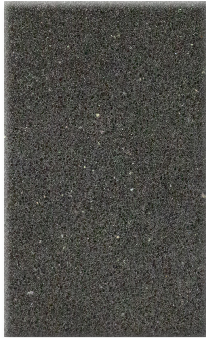
1810-DG17 STORMY SKY GRAY Finish: 200 Diamond Grind Sealer: WB Matte