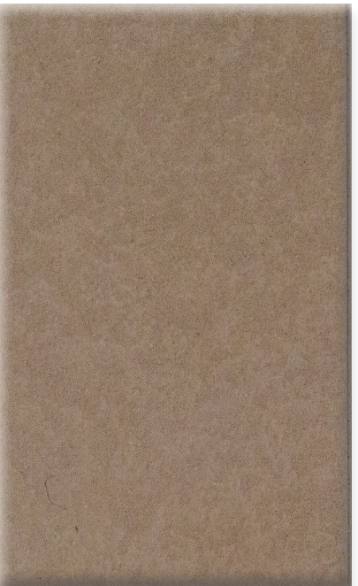
1740-HSN17 HOT SPRING STONES Finish: HS Natural Sealer: WB Matte