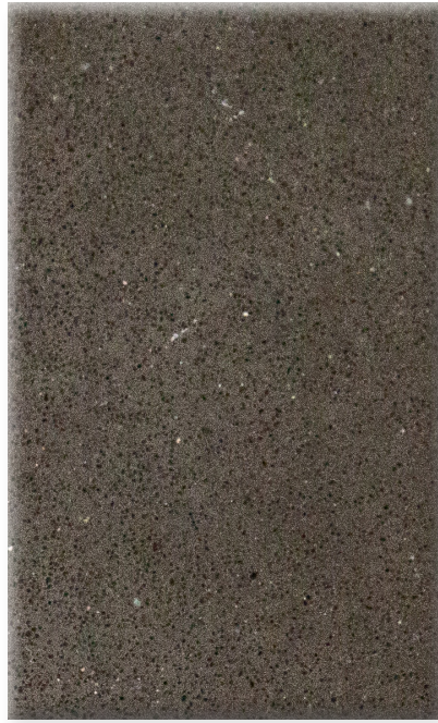
1770-DG17 DUSK Finish: 200 Diamond Grind Sealer: WB Matte