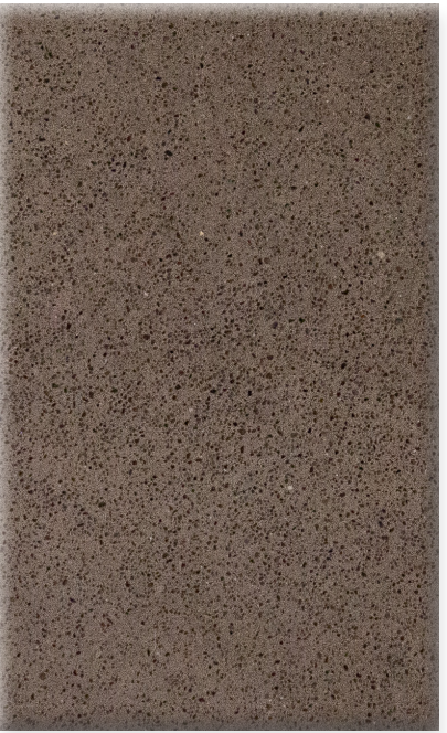
1745-DG17 ALEXANDRIA BEIGE Finish: 200 Diamond Grind Sealer: WB Matte