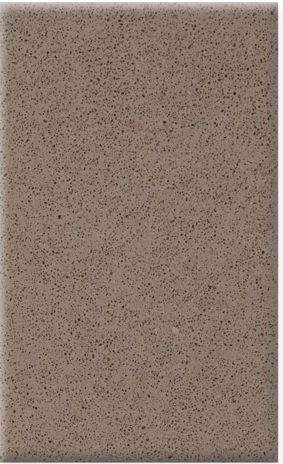
1740-DG17 HOT SPRING STONES Finish: 200 Diamond Grind Sealer: WB Matte