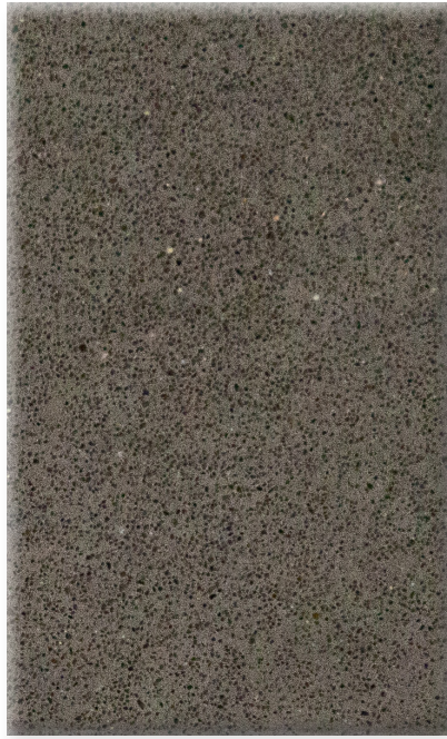
1765-DG17 BEAR CREEK Finish: 200 Diamond Grind Sealer: WB Matte ○