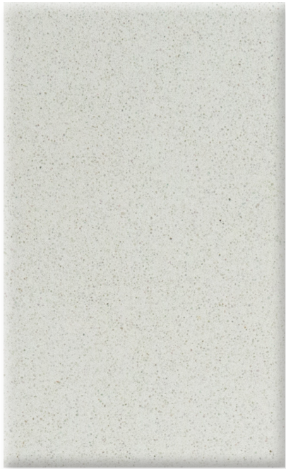
1720-DG17 PAPER WHITE Finish: 200 Diamond Grind Sealer: WB Matte