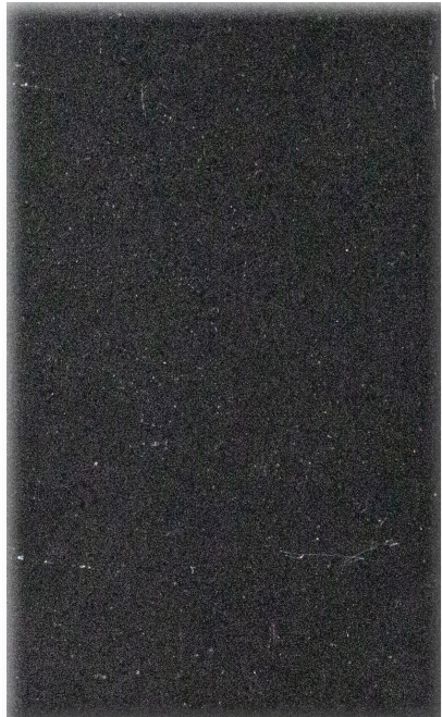
1815-HSN17 HARD TOPIX BLACK Finish: HS Natural Sealer: WB Matte