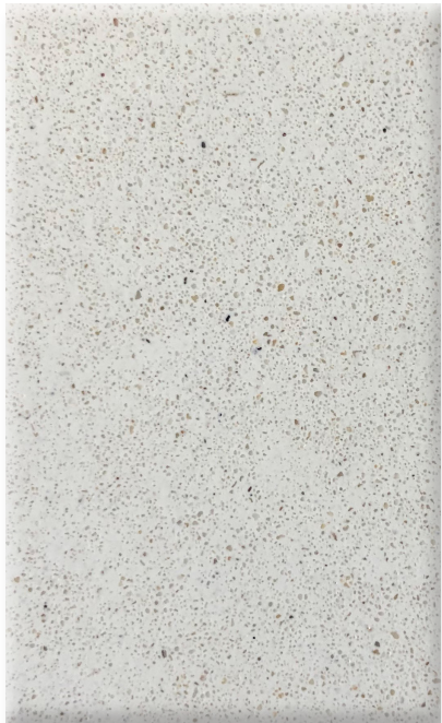
1705-DG17 WHITE SAND Finish: 200 Diamond Grind Sealer: WB Matte