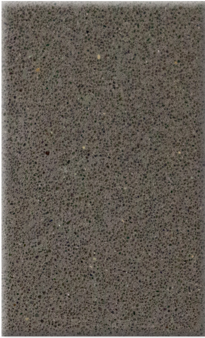
1760-DG17 TWILIGHT GREY Finish: 200 Diamond Grind Sealer: WB Matte ○