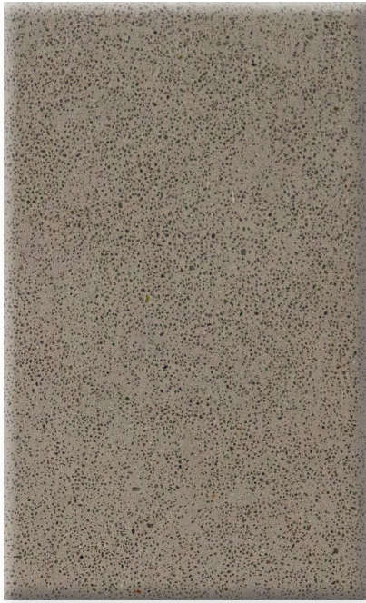
1755-DG17 HARBOR GRAY Finish: 200 Diamond Grind Sealer: WB Matte ○