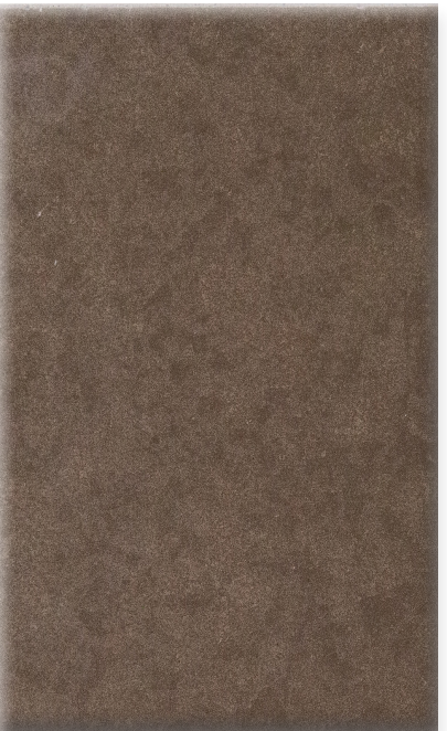
1745-HSN17 ALEXANDRIA BEIGE Finish: HS Natural Sealer: WB Matte