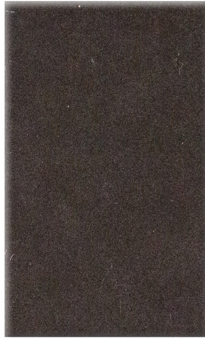
1775-HSN17 IRON MOUNTAIN Finish: HS Natural Sealer: WB Matte