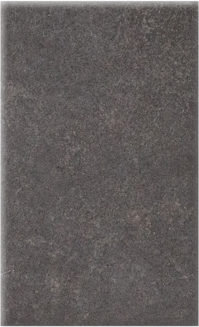
1765-HSN17 BEAR CREEK Finish: HS Natural Sealer: WB Matte