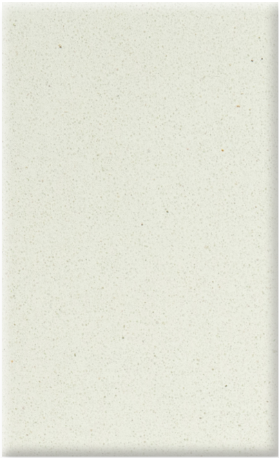
1725-DG17 TITANIUM WHITE Finish: 200 Diamond Grind Sealer: WB Matte