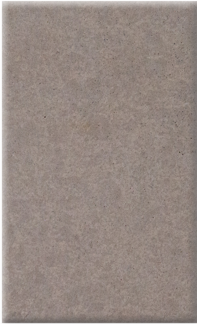
1755-HSN17 HARBOR GRAY Finish: HS Natural Sealer: WB Matte